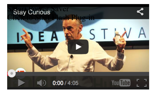
Copyright © 2013 Scientific American All rights reserved.