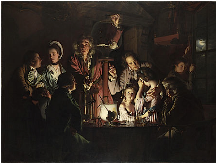
Painting of Experiment 41.

Here is a painting (from the 1760s) of a famous experiment by Robert Boyle (from the 1660s). “Experiment 41” was a demonstration of the reliance of living creatures on air for their survival. Boyle placed a large variety of different creatures, including birds, mice, eels, snails