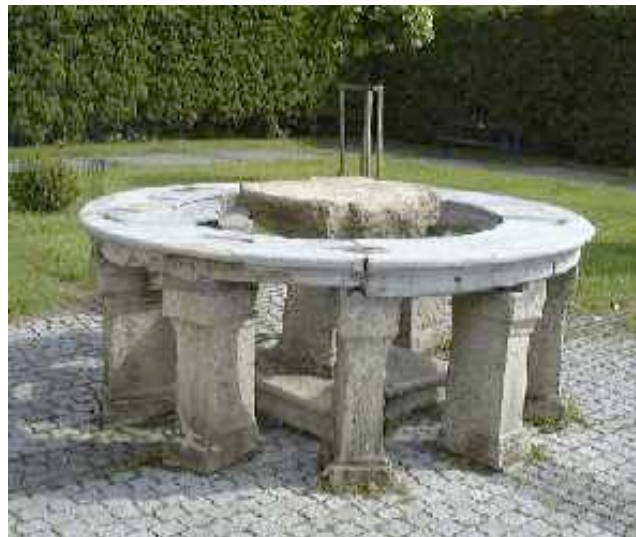
Celtic sacrificial rock.

So the early humans thought there were ghosts and spirits living in the air. They didn't want a ghost angry with them, so they would kill and burn animals, including humans in some cases, in other words, make a sacrifice, to feed these ghosts and spirits. Sacrifice has the root as sacer , meaning sacred 5 .