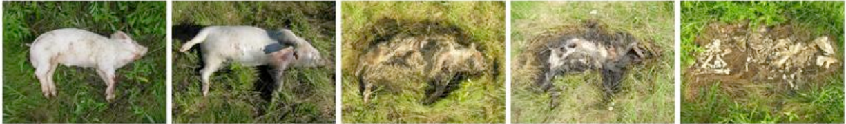
Decomposing pig.

Even if someone died naturally, his or her body would decompose, and once again, it would appear to disappear into the air. For example, examine the photograph of the decomposing pig.