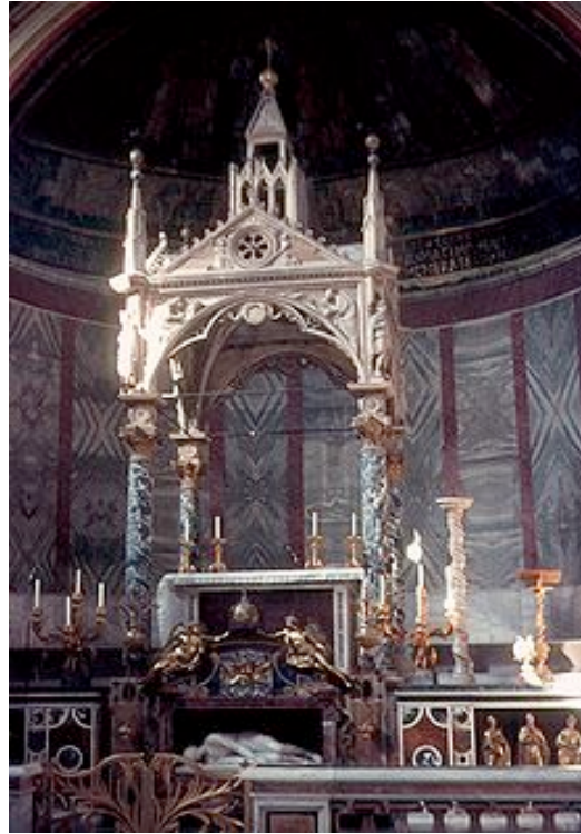
Altar of Santa Cecilia, Wikipedia. Photo credit: Magnus Manske

How did oxygen get discovered? Only relatively recently, in the long history of hominids, have we discovered the nature of the “mysterious” substance in the air that gives life and energy. In the second century BCE, a Greek, Philo of Byzantium, did experiments with an inverted glass (cupping glass) and candle flames and water, and found that the water rose in the glass when the candle burned 7 .