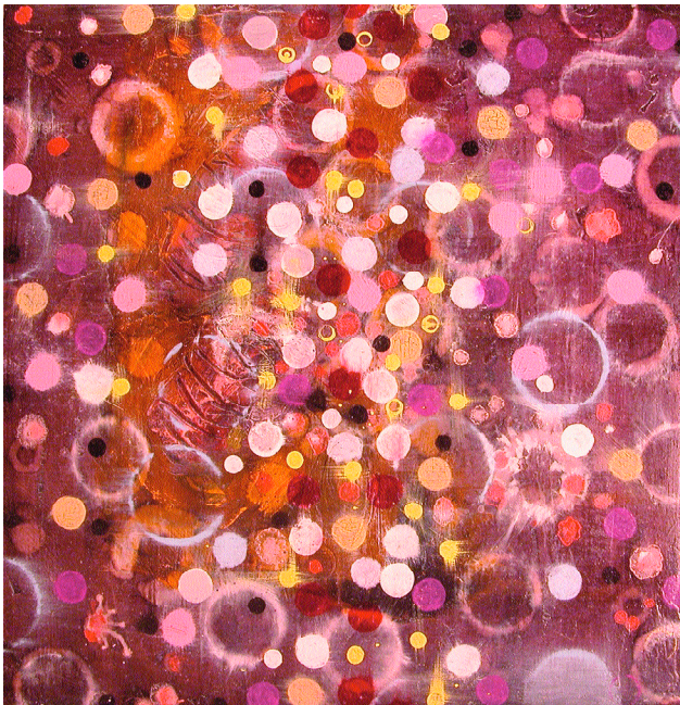
No. 10, 2001–02, oil and beeswax on panel, 11×11 inches

Cognitive scientists study the mind by way of its behavioral and neural physical correlates, and their work would be a lot simpler if quantum mechanics should prove to be irrelevant to the study of the mind-brain problem. But Anton Zeilinger, one of the foremost experimentalists in the foundations of quantum mechanics, declares that the implications of quantum mechanics are so far-reaching that they require a completely novel approach in our view of reality and in the way we see our role in the universe. Quantum effects in the brain can't be counted out. For, according to Zeilinger, there is no limit in principle to the internal complexity, size, or temperature of a system to show quantum effects.